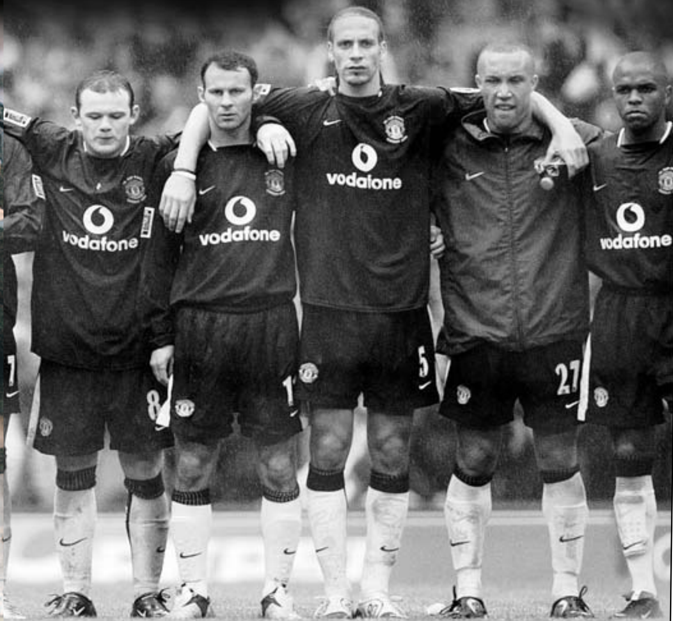
as Paul Scholes walks forlornly back to the centre circle after missing the penalty that cost his team-mates a chance of silverware

to lead United out of the gathering gloom