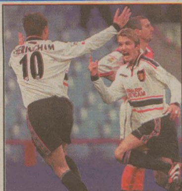
SHERINGHAM and Beckham celebrate