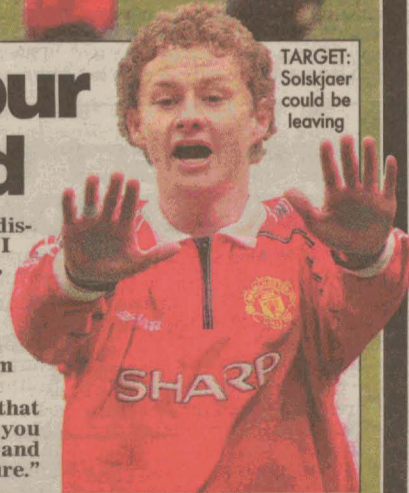
TARGET: Solskjaer could be leaving

"I have always said that after each season you have to sit down and think about your future."