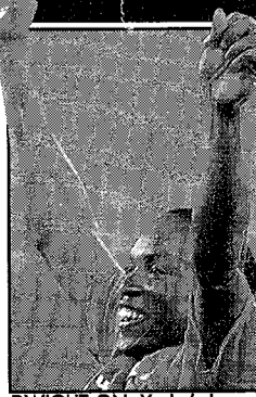
DWIGHT ON: Yorke's happy

Peter Schmeichel is likely to wear the captain's armband in the final in what will be his last game for the club.