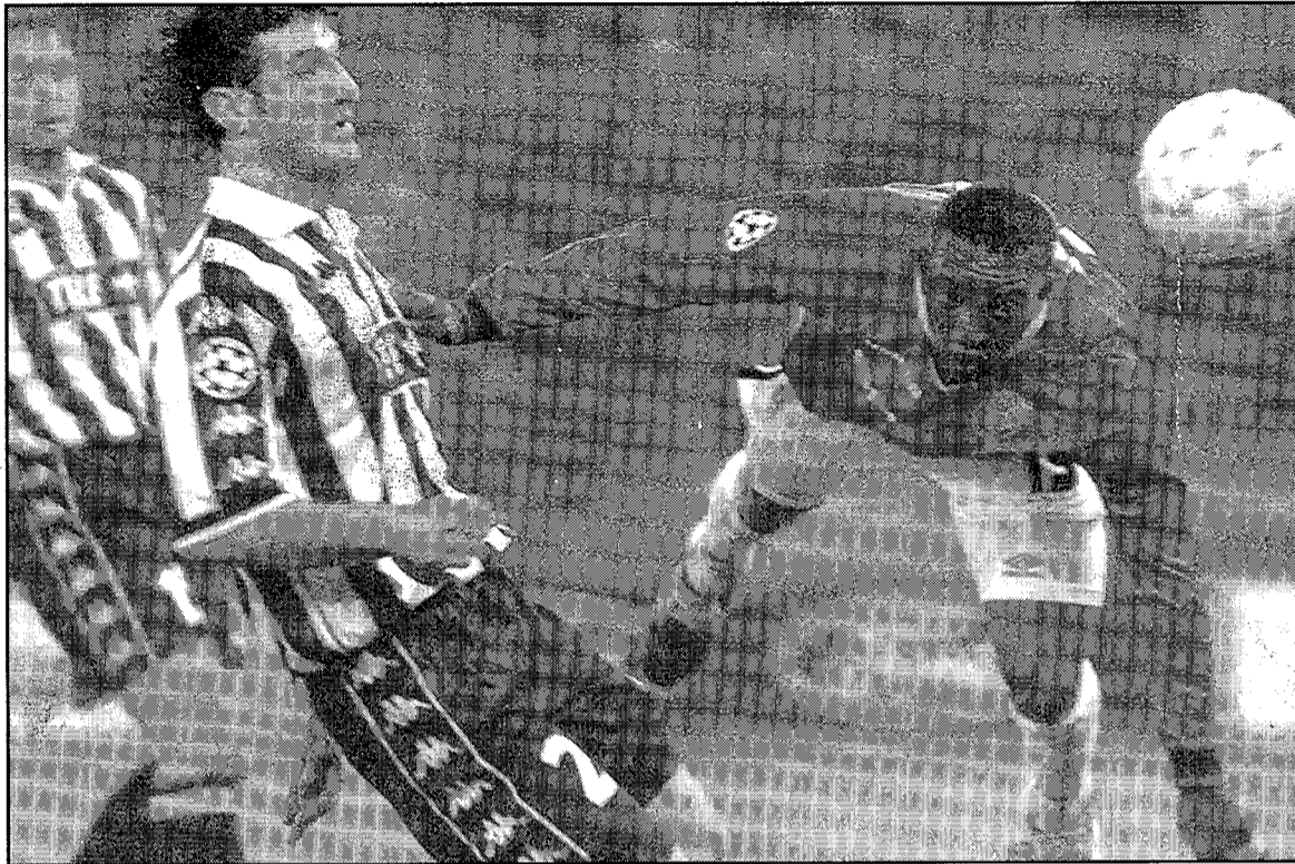
HE STOOPS TO CONQUER: Dwight Yorke heads home and Manchester United pull it back to 2-2

The inspirational Keane was booked in only the 33rd minute for a foul on Zinedine Zidane but there was no discernible change in his determination or commitment to lead his team to the Nou Camp final on May 26, where he will be forced to hand over